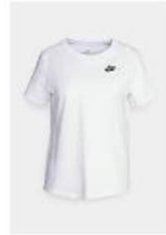
T Shirt with small brand logo