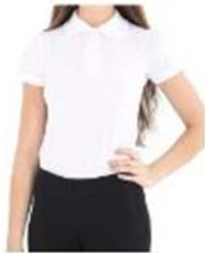
Plain White Polo