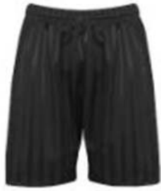
Plain black PE Shorts