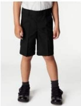
Tailored shorts which meet the knee