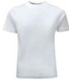
Plain white T Shirt