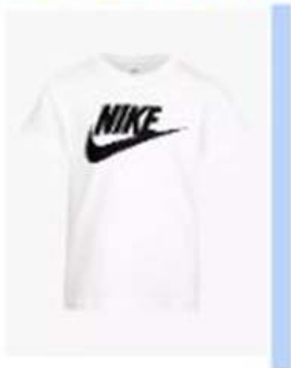
T shirts with large visible brand marks